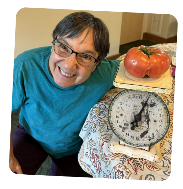
Scenes from around our Home and Grounds