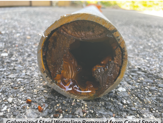
Galvanized Steel Waterline Removed from Crawl Space

For more information and photos please visit our website: https://www.baltimorecarmel.org/renovation